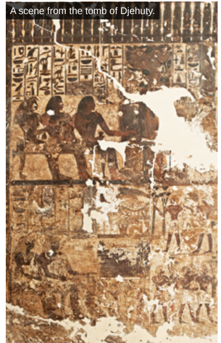
A scene from the tomb of Djehuty.