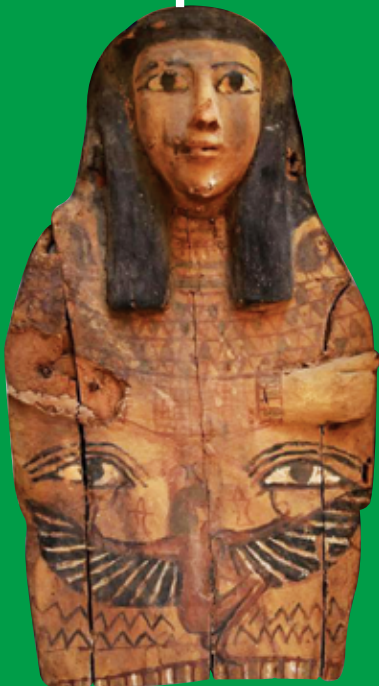
A sarcophagus lid, repatriated from Israel.

A dyad of black steatite stone, on sale in Belgium (April 2016).