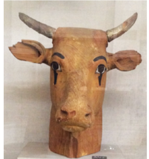
One of the objects displayed in the Sinai exhibition.