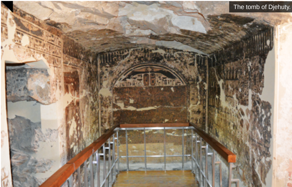
The tomb of Djehuty.