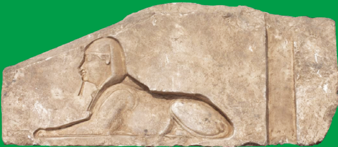
A fragment from Heliopolis.

• The Egyptian-German joint mission in Heliopolis (al-Matariya) succeeded in finding new evidence suggesting the existence of a Temple of King Nektanebo I dating back to the 30 th Dynasty in the area of the Sun Temple, in addition to industrial workshops from the 4 th century B.C. and later layers dating to the Ptolemaic Period.