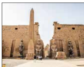
Decisions of the SCA to promote Cultural Tourism P. 6