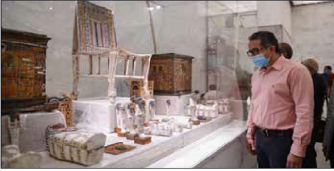
The Minister Inside one of the Halls of NMEC

The Minister of Tourism and Antiquities followed up on the latest developments in the central exhibition hall of the National Museum of Egyptian Civilization in Al-Fustat, in preparation for its forthcoming opening. After the visit, the Minister met the museum's archaeologists, restorers, and members of the Supreme Committee for the Museum's display scenario; where they discussed the ongoing preparations for the process of transporting the Royal Mummies from the Egyptian Museum in Al-Tahrir in a big royal procession and how they will be displayed in the hall designated for them in the museum.