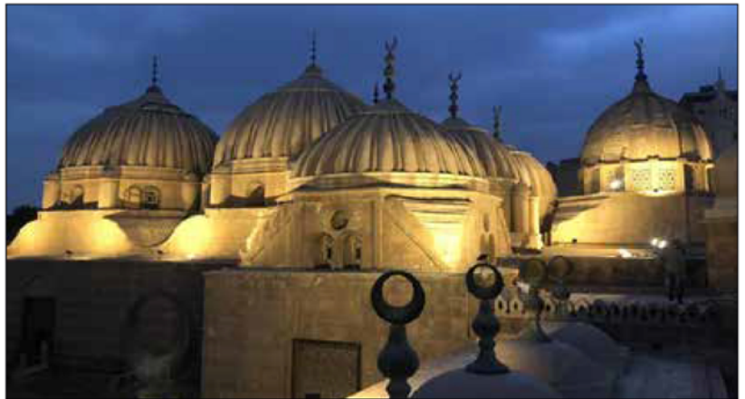
Dome of the Alaouite Dynasty

The General Administration of Historic Cairo in cooperation with the Imam Al-Shafi'i archeological site; has lit the domes of the the Alaouite dynasty tombs as part of the project to develop the area surrounding the National Museum of Egyptian Civilization in Al-Fustat. This project is carried out by the ministries of Tourism, Antiquities, Housing, New Urban Communities, and Cairo governorate. these tombs; known as Hosh al-Basha, were built by Muhammad Ali as a burial ground for him and his family in 1816 AD, however he was buried in his mosque in Salah El Din Castle.