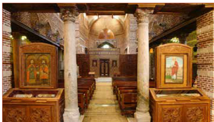
Inside the church of Abu Sarjah

The Ministry of Tourism and Antiquities celebrated the anniversary of the entry of the Holy Family into Egypt, which is on the first of June every year. This year the ministry launched a virtual tour of the Church of Saints Sergius and Bacchus known as the Church of Abu Sarjah. This church is one of the main destinations on the journey of the Holy Family within Egypt, which included more than 25 places in different parts of Egypt from the coast of Sinai in the east through the Nile Delta until the far reaches of Upper Egypt.