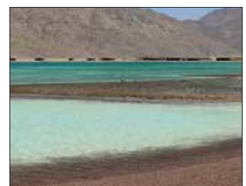
Journey to the Sands of Gold p. 8