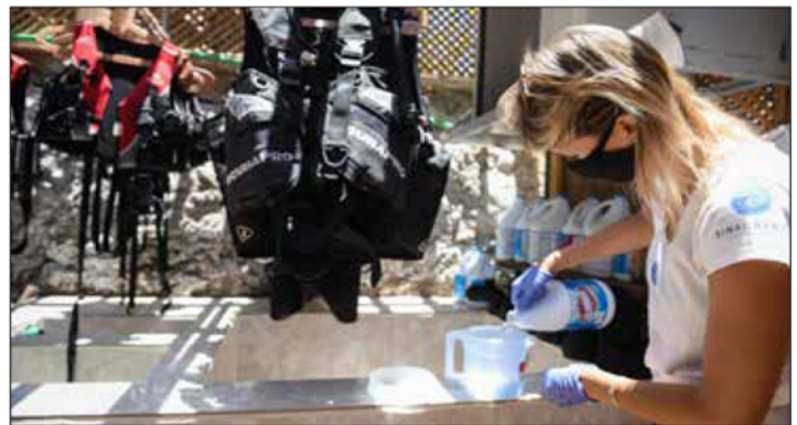
Disinfection of Diving Equipment in one of the Certified Centers

In a related context, 8 diving centers, 6 yachts and 2 marine activities centers in the Red Sea and South Sinai governorates received hygiene safety certificates approved by the ministries of Tourism and Antiquities, Health and Population, and the Chamber of Diving and Water Sports.