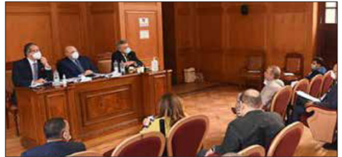
Minister of Tourism and Antiquities in Parliament

The members of the committees have agreed in principle on the draft law of the Tourism and Antiquities Fund, with some amendments to some clauses and formulations concerning sources of funding.