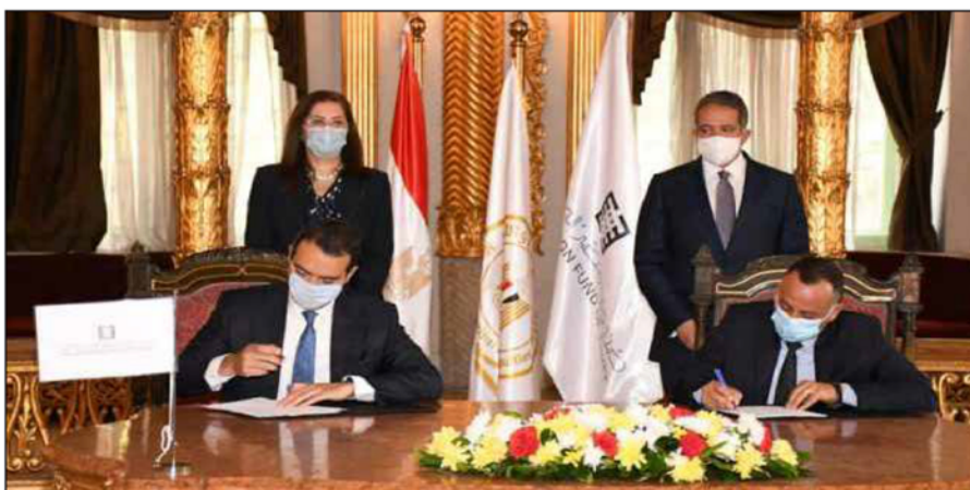
Signing the Protocol

The Sovereign Egypt Fund signed a cooperation protocol with the Ministry of Tourism and Antiquities to provide and operate services in the Bab al-Azab archaeological site in Salah El Din Citadel. This step is considered the first project of Egypt's sovereign fund for investment in the tourism, cultural and service sector in cooperation with the Ministry of Tourism and Antiquities. This comes within the framework of the project to rehabilitate Historical Cairo and in light of the government's keenness to improve the quality of services provided to visitors.