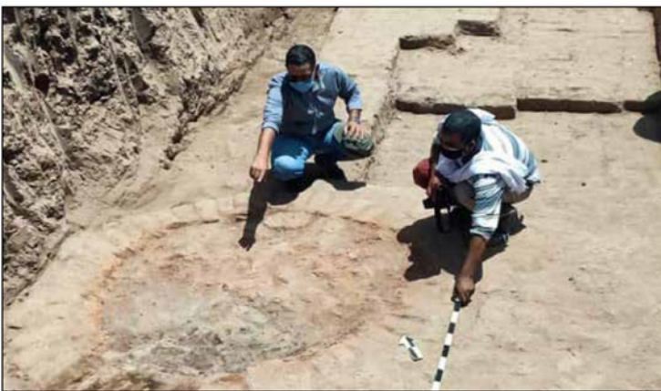
Part of the Discovered Ovens

The Egyptian archaeological mission discovered a number of round burning ovens of mud-brick with burning marks, which might have been used in the manufacturing of pottery or faience.