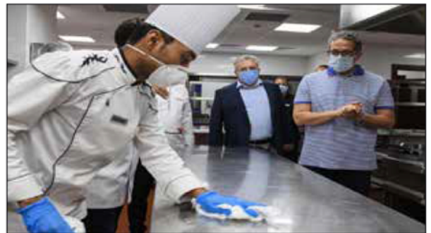
The Minister of Tourism and Antiquities Inspects a Hotel

In preparation for the resumption of inbound tourism to coastal touristic governorates from 1 July, 2020, the Minister of Tourism and Antiquities, accompanied a delegation of Egyptian and foreign media to visit a number of touristic governorates. The visits were organized by the Egyptian Tourism Promotion Board to the governorates of the Red Sea, South Sinai, Alexandria and Matrouh to inform the media about the precautionary measures implemented in all places that will receive tourists, including airports, hotels, clinics, hospitals, and diving centers, in addition to archaeological sites and museums.