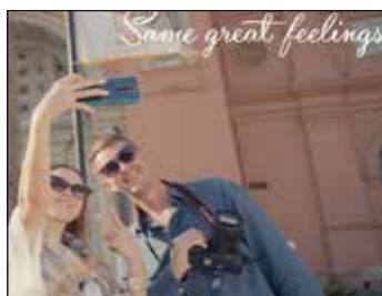
The Ministry launches the Film "A Tourist's Journey in Egypt" P. 4