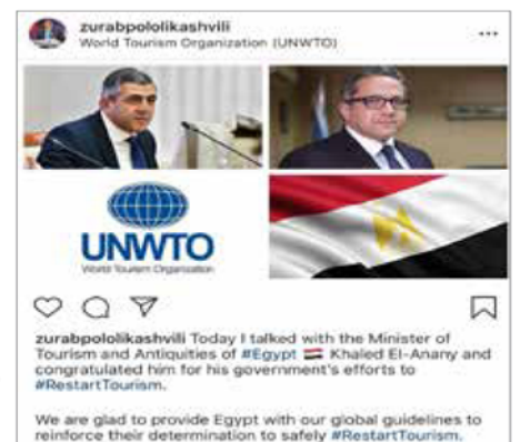
Tweet of the Secretary-General of the UNWTO

The Minister of Tourism and Antiquities held a video conference with the Secretary General of the United Nations World Tourism Organization (UNWTO). During the meeting, H.E. the Minister reviewed hygiene safety measures issued by the Ministry for operating hotel and tourist establishments, tourism activities, archaeological sites and museums in preparation for the resumption of the incoming tourism movement. In another context, the Minister of Tourism and Antiquities met with the Director General of the Islamic World Organization for Education, Science and Culture "ISESCO", via video conference. An agreement to broadcast virtual tours launched by the Ministry during the past months on its official platforms on social media, on the ESICO Heritage Portal and the ISESCO Digital House was made.