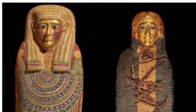
A Number of Pieces Received by the Airport Museum

Cairo International Airport Museum received 12 artifacts, from the storage areas of the Egyptian Museum in Al-Tahrir and the Suez National Museum, to be displayed in it. They included three mummies decorated with gilded cartoons and colorful drawings, canopic jars, a statue of the winged god Isis made of bronze, and statuettes from the Greco-Roman era.