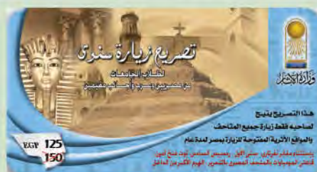
Annual pass for Egyptian, Arab and foreign university students residing in Egypt