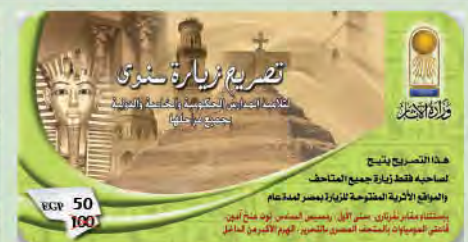
Annual pass for pupils of Egyptian governmental (secondary), private and international schools in Egypt