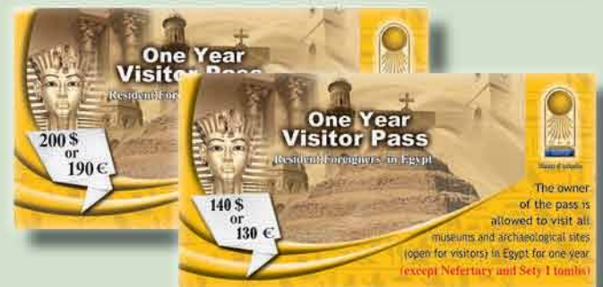
Annual pass for foreign residents in Egypt