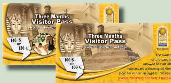
Three months pass for foreign residents in Egypt