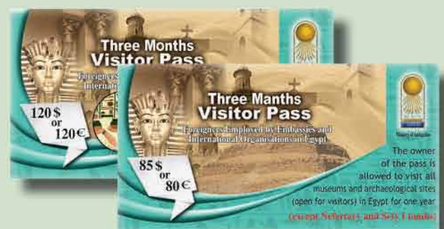
Three months pass for foreigners employed by embassies and international organizations in Egypt

To purchase the pass: Original Passport + One Personal Photo *New ticket prices for Egyptians starting from April 2018*