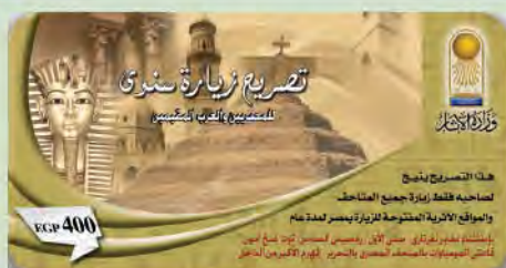
Annual pass for Egyptians and Arabs residing in Egypt