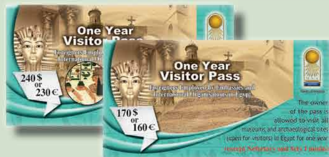
Annual pass for foreigners employed by embassies and international organizations in Egypt